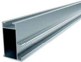
VS+ MONTAGESCHIENE 60 X 38 MM VS+ MOUNTING RAIL 60 X 38 MM